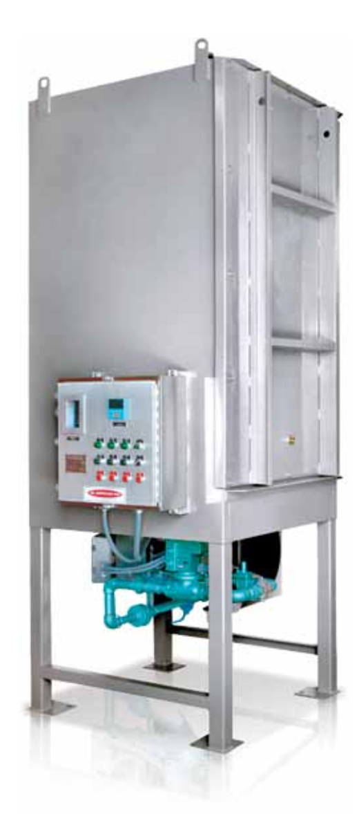
CTHX casing is available in painted steel or optional stainless steel as shown

Pre-piped and pre-wired, the CTHX is ready for operation, and available in models to deliver from 150,000 to 3 million BTU/hour transfer to the cooking oil.