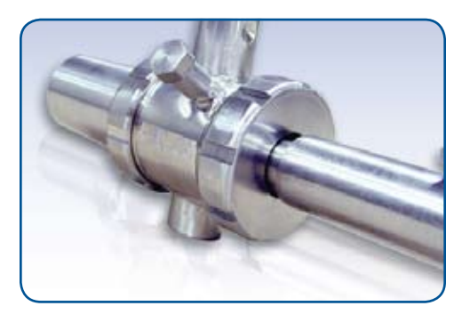
Reliable and efficient, our 40-Series positive displacement airless pump reduces overspray and waste.

Constant improvement and engineering innovations mean these specifications may change without notice.