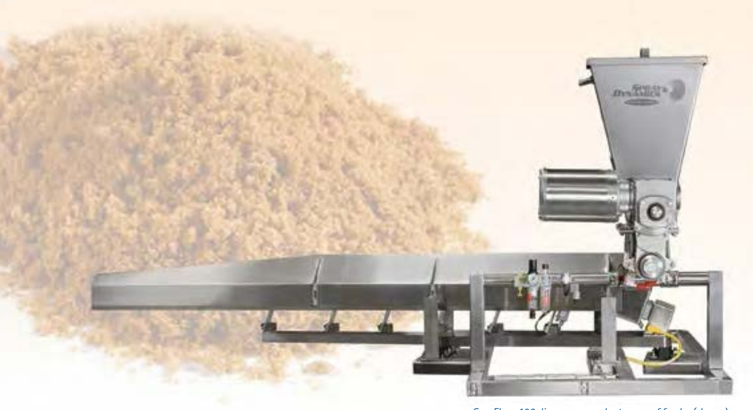
SureFlow-100 dispenses powder to a scarf feeder (shown) and other types of applicators.