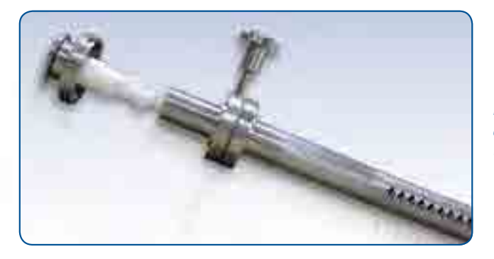
Precisely adjust seasoning delivery with our simple Uni-Spense worm gear control.